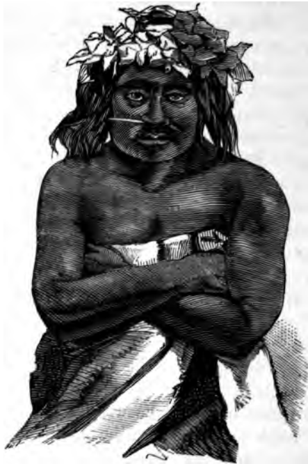
SCOMAX, CHIEF OF THE VICTORIA TRIBE, VANCOUVER'S ISLAND.

different flowers, fruits, or leaves belonging to each tree, as creeping and climbing plants attach themselves to the trunk of each tree, and mount the summit a height of more than a hundred feet.